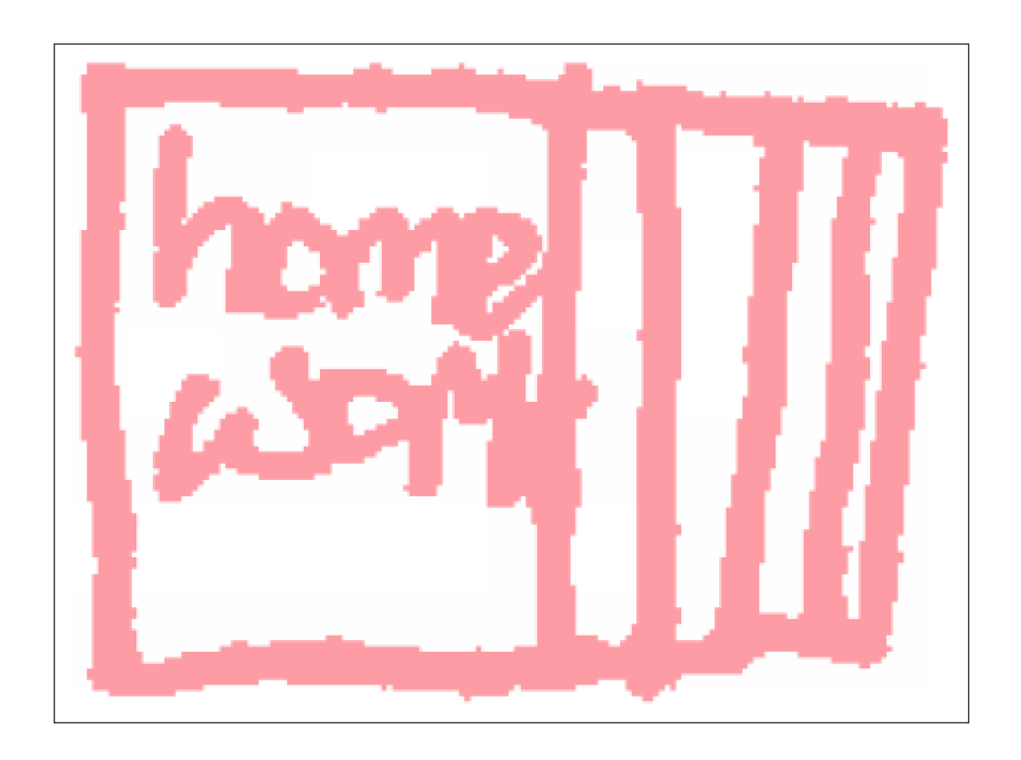
Figure 2 Schoolwork and Homework.

During the 2020–2021 school year, a new grading system had been mandated by the district with the justification that it would help parents better understand their children's grades. All teachers at the high school had to follow a "70–30" guideline. Specifically, 70% of students' grades had to be based on practice activities, and 30% on quizzes, tests, and projects. "It was a way to pass more kids, plain and simple, by reducing the challenge of passing. It made the classes easier inherently, so to get around the guideline, my homework became harder and worded in a way that students couldn't just look it up online especially since we had to teach the same amount of material ... Our entire math department had the same idea too," remarked one teacher when reflecting on the 70–30 guideline.